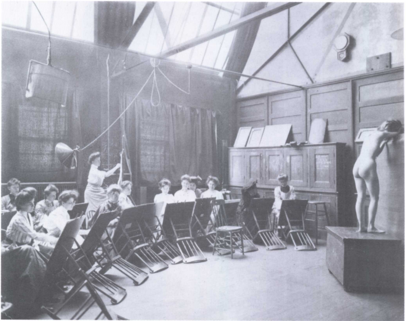
Kenyon Cox's Women's Life Class at the League, 1903

The League's commitment to women artists is matched only by our support of of all our students. Please join us at the League.